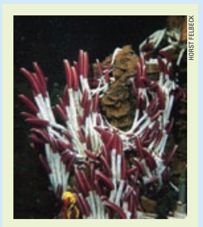
Under the sea. A colony of R. pachyptila no doubt enjoying an H_2S snack in a deep-sea hydrothermal vent.

Freezing, however, did not have a negative effect on the urine specimens, and preservatives were not necessary when the samples were frozen. In fact, the researchers caution against using sodium fluoride because several artifacts were observed in these samples. Because freeze-drying caused several changes to <sup>1</sup>H-NMR spectra, this method of storage is not recommended. ( Anal. Chem. 2007 , 79, 1181–1186)